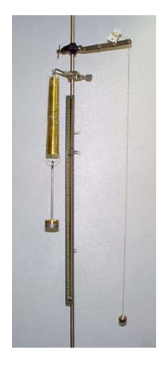
Figure 2. Apparatus for simple pendulum.