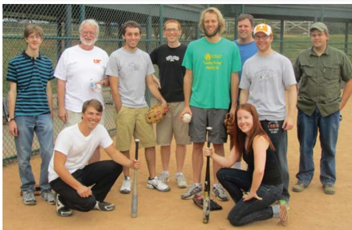
The Graduate Physics Society hosted a fall picnic in October, where faculty and students had the opportunity to show off their athleticism (and knowledge of moving objects) with a softball game.